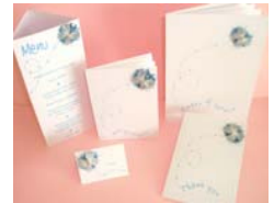
Flutter Collection in Blue

A small printed card with envelope which is printed with the RSVP address. Perfect for a fast and accurate response. Guests can also indicate if they require a vegetarian meal