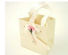
Favour Bag Roses - Pink & Ivory

Adorable handmade bags with satin ribbon handles. Decorated with your chosen design. The bags are available in Ivory or White with matching ribbon handles. Size 750x750x500mm Depth.