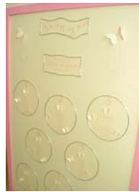
Summer - Pink

Gorgeous handcrafted photo album made from high quality paper with padded cover. Matches our guest books. Pages are interleaved with tissue-like sheets. Complete with its own matching quality box. Approx 20 pages (40 sides). Decorated with our designs. Size 32 x 28cm Ivory or White