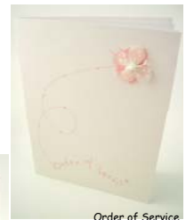
Order of Service Flutter - Pink

Welcomes and guides your guests through the ceremony providing the hymns or the events of the day. Size 148 x 210 folded (Double the size of invitation)