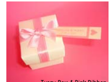
Ivory Box & Pink Ribbon Featuring Tag

Finest gorgeous little boxes. The ribbon is tied around the lid making it easy for you to fill without having to re-tie. The ribbon is available in many colours to co-ordinate with your stationery. Unlike many other stationers and favour suppliers - we supply these boxes already constructed with tissue paper and ready to fill! Size 50 x 50 x 50mm