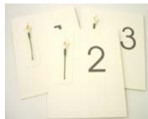
Table Number Cards for stands