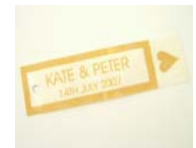
Gold Favour Tag

Available with either Bride & Grooms' names with wedding date or each individual guest names which can double up as Place Cards. The front of the label has a clear shimmering holographic plastic covering.