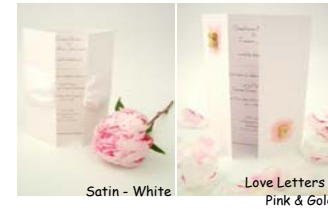
Satin - White