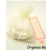
Organza Bag featuring Tag

White or Ivory organza bag with satin drawstring. Ideal if you want to show attractive contents. Filling not included. Size 100 x 70mm