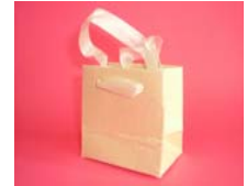
Ivory Favour Bag

Adorable handmade bags with satin ribbon handles. If tags are required, these are attached to the ribbon handles. The bags are available in Ivory or White with matching satin ribbon handles. Size 750x750mmx500mm Depth.