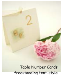
Table Number Cards freestanding tent-style

Both types of number cards are decorated to match our designs. Available as single or double-sided.