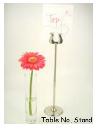
Table No. Stand

Silver table number stand with slot for holding cards with table number or name. Height approx 30 cm high