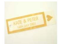
Gold Favour Tag

Available with either Bride & Grooms' names with wedding date or each individual guest names which can double up as Place Cards. The front of the label has a clear shimmering holographic plastic covering.