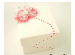
Favour Box Flutter - Fuchsia

Finest cube boxes decorated to co-ordinate with your chosen design. Removable lid so it is easy for you to fill with little gifts, almonds or chocolates. White or Ivory with matching tissue paper - Size 50x50x50mm