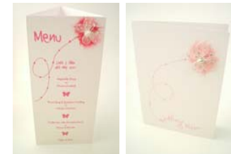
Three-side menu Flutter - Fuchsia

The Standard menus are the same style and size as the invitations with a single page insert (A6)