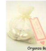
Organza Bag featuring Tag

White or Ivory organza bag with satin drawstring. Ideal if you want to show attractive contents. Filling not included. Size 100 x 70mm